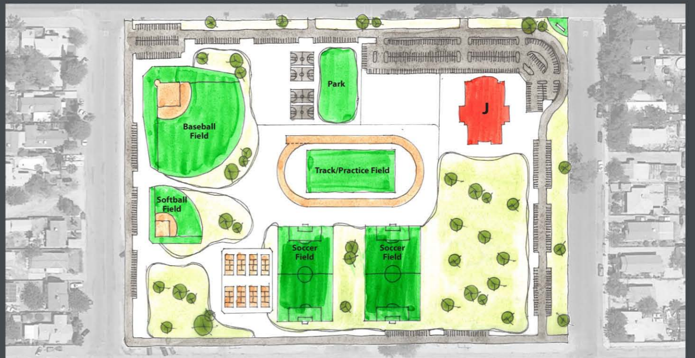
FIELD SPORTS COMPLEX/PHYSICAL EDUCATION CENTER