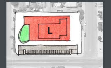
OFFSITE INDUSTRY EDUCATION CENTER